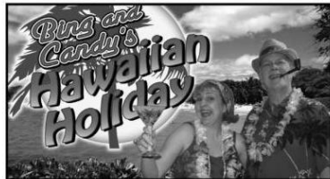
BUFFA! DUET PROGRAMS