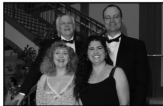
FOUR WHEEL JIVE