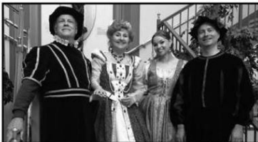
THE ELIZABETHAN CONSORT